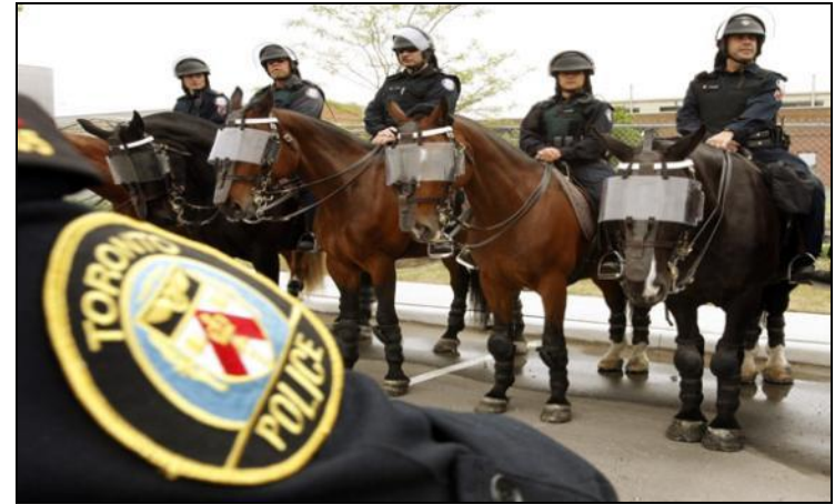
June 8, 2010

Conversion of training videos for online delivery; hosting via OPVTA Web portal.